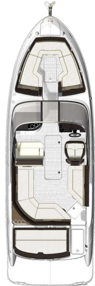
Optional Port Convertible Seat