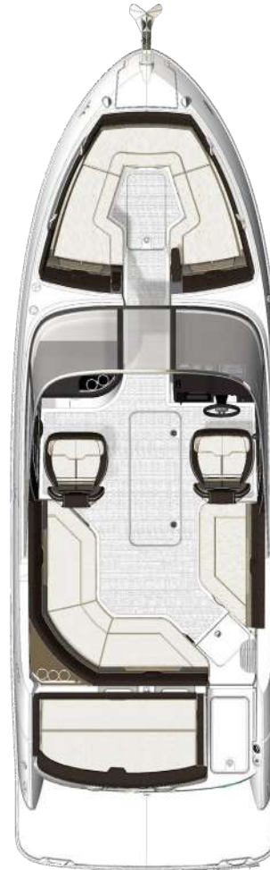
Standard Two Bucket Seats

Painted Tandem Axle Trailer w/ Bunks & Tandem Axle Disc Brakes Galvanized Tandem Axle Trailer w/ Bunks & Tandem Axle Disc Brakes Painted Tandem Axle Trailer w/ Rollers & Tandem Axle Disc Brakes Galvanized Tandem Axle Trailer w/ Rollers & Tandem Axle Disc Brakes