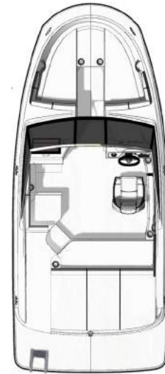
Standard Seating Plan

3400lb Trailer Single Axle W/ Single Axle Disc Brakes (Galvanized) 5000lb Trailer Tandem Axle W/ Single Axle Disc Brakes (Painted) 5000lb Trailer Tandem Axle W/ Single Axle Disc Brakes (Galvanized) 5000lb Trailer Tandem Axle W/ Tandem Axle Disc Brakes (Painted) 5000lb Trailer Tandem Axle W/ Tandem Axle Disc Brakes (Galvanized) 5000lb Premium Trailer Tandem Axle W/ Single Axle Disc Brakes (Painted) 5000lb Premium Trailer Tandem Axle W/ Tandem Axle Disc Brakes (Painted)