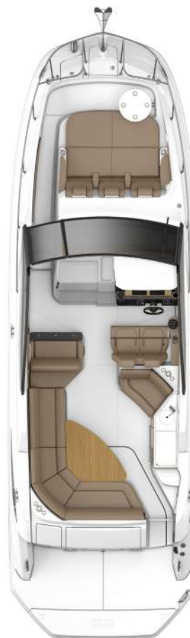
DECK / COCKPIT LAYOUT (Shown w/ Optional Equipment)

NOTE: Some features and options may not be available when a boat is built for regions outside North America and/ or has CE Certification. Boats ordered with 220V/50 cycle electrical systems will have the appropriate appliances in the corresponding voltage.